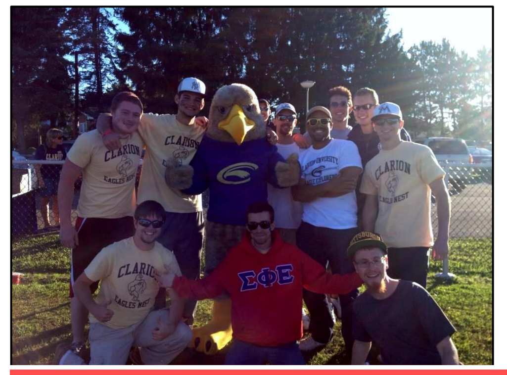
BROTHERS POSE WITH ERNIE THE EAGLE AT A GOLDEN EAGLE FOOTBALL GAME